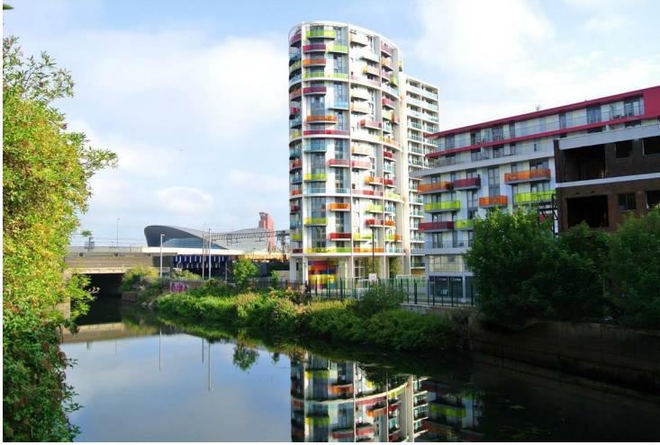
ICONA POINT BUILDING